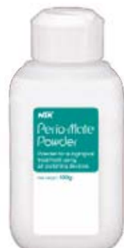
Perio-Mate Powder Powder for subgingival treatment using air-polishing devices