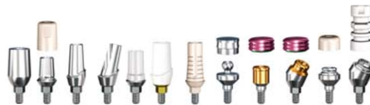
Laboratory Abutment Straight Snap-On Straight Contoured 15° Angled Contoured Gold/Plastic Abutment Zirconia/Ti Abutment Plastic Temporary Abutment Ball Attachment GPS™ Attachment Angled GPS™ Attachment Multiple-Unit w/Cap & Transfer Straight Multiple-Unit w/Cap & Transfer Angled €60 €75 €75 €75 €90 €90 €30 €68 €90 €90 €75 €90