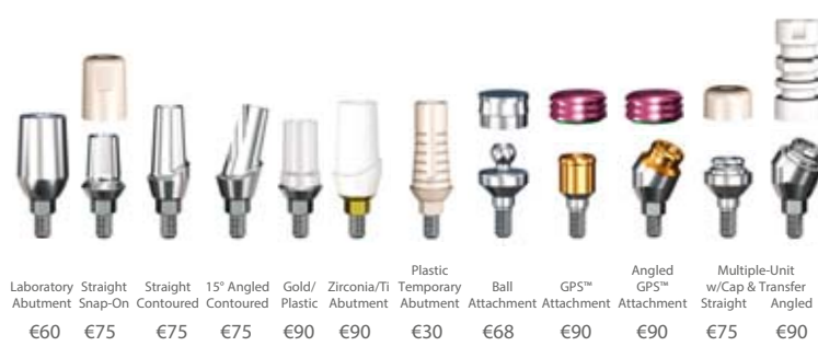
Laboratory Abutment Straight Snap-On Straight Contoured 15° Angled Contoured Gold/Plastic Zirconia/Ti Abutment Plastic Temporary Abutment Ball Attachment GPS™ Attachment Angled GPS™ Attachment Multiple-Unit w/Cap & Transfer Straight Multiple-Unit w/Cap & Transfer Angled €60 €75 €75 €75 €90 €90 €30 €68 €90 €90 €75 €90