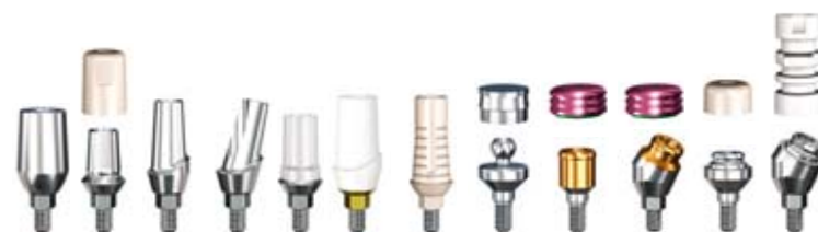
Laboratory Abutment Straight Snap-On Straight Contoured 15° Angled Contoured Gold/Plastic Zirconia/Ti Abutment Plastic Temporary Abutment Ball Attachment GPS™ Attachment Angled GP5™ Attachment Multiple-Unit w/Cap & Transfer Straight Multiple-Unit w/Cap & Transfer Angled €60 €75 €75 €75 €90 €90 €30 €68 €90 €90 €75 €90

(3.2, 3.7, 4.2, 4.7, 5.2, 5.7, 7.0mm) & six implant lengths (6, 8, 10, 11.5, 13, 16mm)