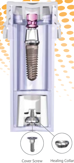
Cover Screw Healing Collar