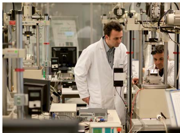
Research, development and clinical testing – the way to innovative products.

In order to reduce costs, low-price manufacturers conduct little or no clinical research to prove that their implants will deliver long-term function and