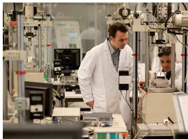
Research, development and clinical testing – the way to innovative products.

they could well be cheaper in the long run. The question is: Can doctors and patients afford to save in the short term?