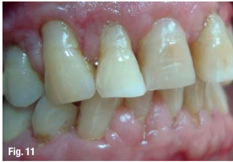
Fig. 11 _Before gingivectomy.