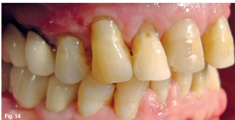
Fig. 14 _Six months after laser gingivectomy.

The intraoral examination revealed generalised, grade II gingival enlargement 20 in the anterior segment of the mandible (case I and case II) and the maxilla (case II). There was a high score of debris and calculus index according to Greene-Vermillion index. 21 The gingiva showed signs of inflammation as redness, bleeding on probing and suppuration. Halitosis was also detected. The measurement of pocket probing depth revealed deep pockets of about 7–8 mm (Figs. 2–14).