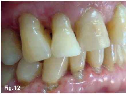
Fig. 12 _One week after laser gingivectomy.