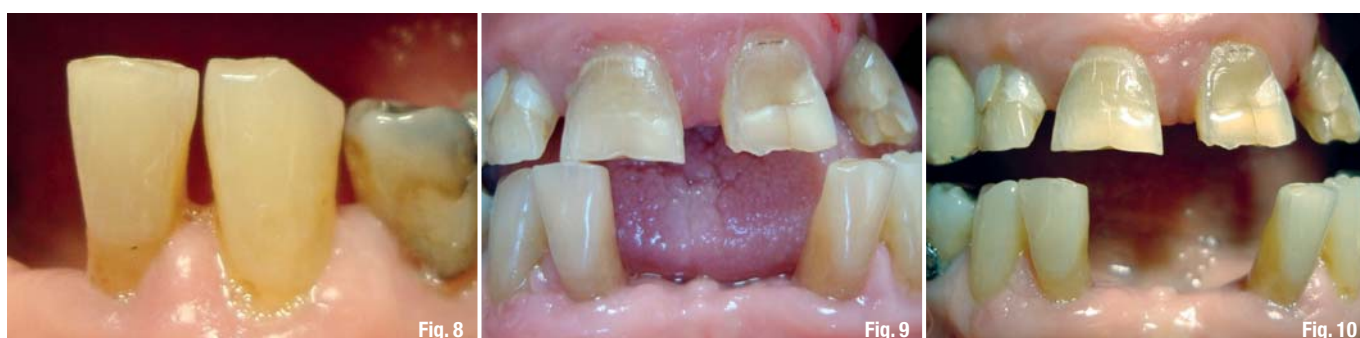
Fig. 10 _Six months after laser gingivectomy.