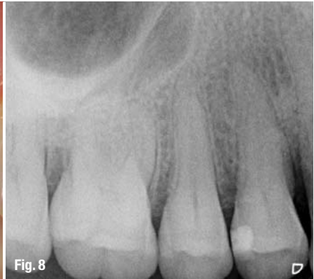
Fig. 6 _Suturing. Fig. 7 _ Six years after radiation. Fig. 8 _Radiograph six years after radiation.

were isolated (Fig. 3). No clinically detectable mobility of the teeth was present. One day prior to surgery, the patient was given 2,000 mg of amoxicillin and following surgery put on a regimen of amoxicillin (1,000 mg tid) for five days post-op. A crestal incision is scalloped around the teeth necks to eliminate the internal epithelium and granulation tissue from the pocket (Fig. 4). A mucoperiosteal flap is raised to expose the teeth, and bone tissue and granulation tissue are eliminated from the bone defect with Nd:YAG laser with 300 µm tip, VSP, 1.5 Hz, 10 W power setting was used and Er:YAG laser with power settings of VSP, 120 mJ, 10 Hz with water and air flushing was used for teeth surface detoxification. Due to defect morphology we used a combined technique with enamel matrix derivative (Emdogain). Then, xenogenous bone grafts (Bio-Oss®) were compacted into the defect (Fig. 5). A Bio-Gide® barrier was placed over the defect and was extended both buccally and lingually.