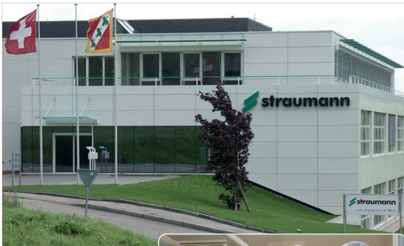
Fig. 1_ The Straumann production site is located in Villeret, a French-speaking municipality in the canton of Bern in Switzerland.