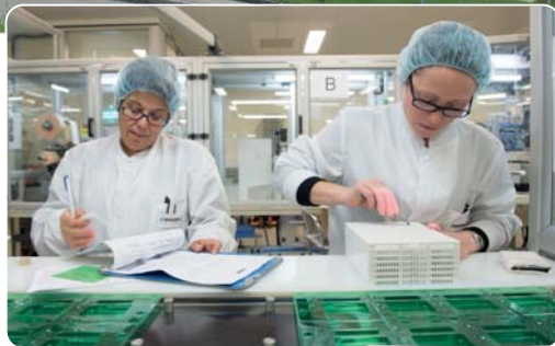
Fig. 2_ Packaging in Villeret.

_Straumann's manufacturing plant in Villeret in Switzerland recently opened its doors to representatives of the press to learn more about the manufacture of its dental implant products. The plant is Straumann's most important production site and one of the largest state-of-the-art facilities in the dental implant segment. It currently produces more than five million components per year.