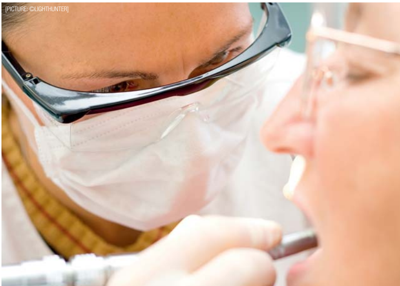
Access to specialist treatment services within the NHS remain very patchy.

The impact of the well documented rise in the numbers of older people may be particularly impor-