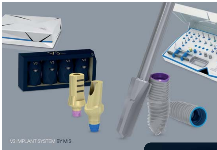
V3 IMPLANT SYSTEM BY MIS

MIS Implants Technologies recently launched the new V3, a multi-use implant suitable for a wide range of surgical scenarios that is part of the company's V-Concept. "MIS Implants is now a frontrunner of innovation in implant dentistry"—this was the powerful message at the product launch at EuroPerio8 in London.