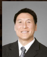
Dr. Stephen Chu