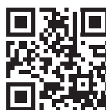
Competition specifications and requirements

You are requested to submit a case documentation by February 15, 2016. Please e-mail michal@mis-implants.com . Please note that all cases must be in English.