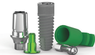
This visual belongs to "Tpure All in One Package"

The new product of NucleOSS family has a deep connection and aggressive grooves. (Packaging includes Cover Screw)