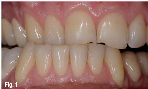
Figs. 1–3 Initial situation with pronounced habitual dysfunction.

The following case study demonstrates the interaction between aesthetics and function in the preparation of veneers in a patient with severely advanced habitual dysfunction. The patient also had severely damaged upper anterior teeth due to extreme latero-trusion habits.