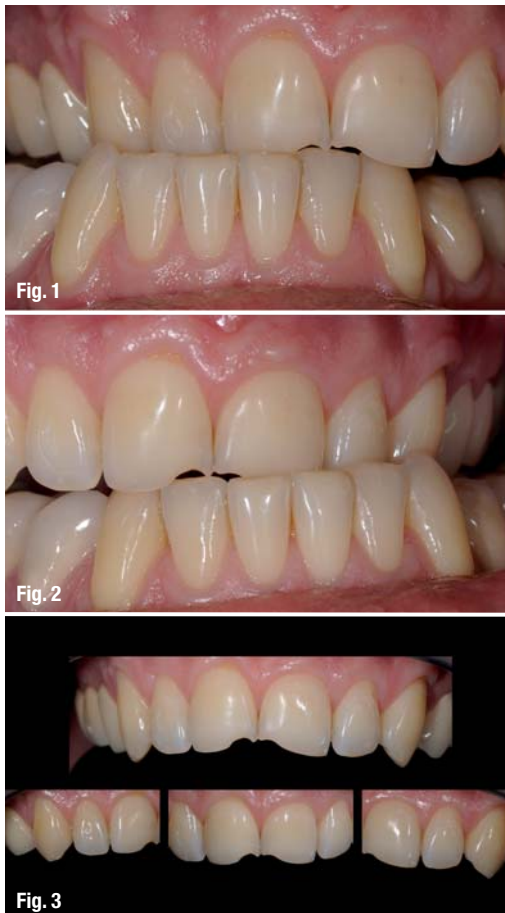
Figs. 1–3 Initial situation with pronounced habitual dysfunction.

The following case study demonstrates the interaction between aesthetics and function in the preparation of veneers in a patient with severely advanced habitual dysfunction. The patient also had severely damaged upper anterior teeth due to extreme latero-trusion habits.