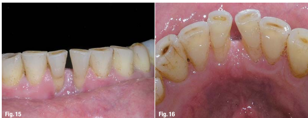
Fig. 16 _Lingual view of the same patient with mobile lower central incisors.