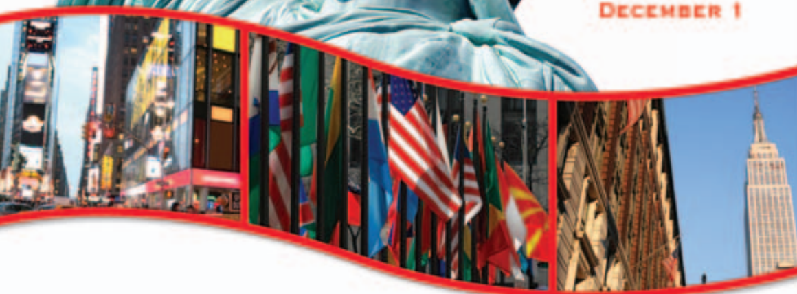
EXHIBIT DATES: NOVEMBER 28 - DECEMBER 1