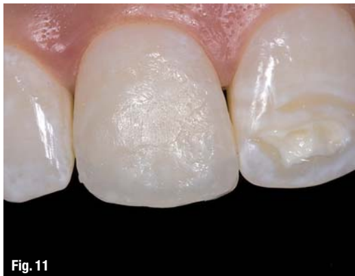
Fig. 12 _ Post-op view of the minimally invasive, aesthetic restorations fabricated with the IPS Empress Direct composite resin system.