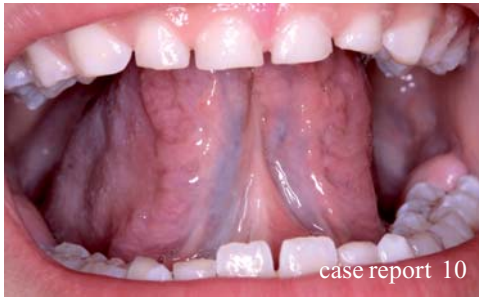
case report 10