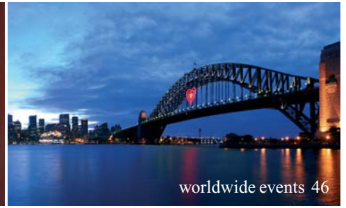
worldwide events 46