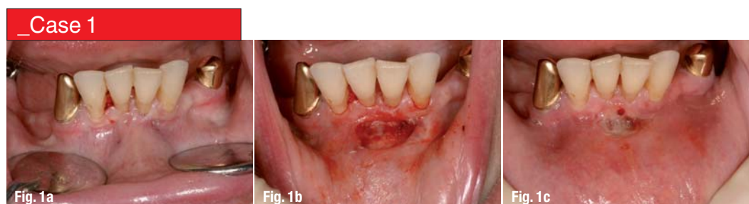
Fig. 1a_Frenectomy in the lower jaw — situation before excision.

Main indications of the postimplantologic use of lasers are uncovering the implant and periimplantitis therapy. 4 The advantage of the application of lasers in implant uncovering is the immediately possible impression of the situation due to the reduced bleeding area and a faster healing without the requirement of removal of seams. However, adequate soft tissue support with adequate supply of attached gingiva is necessary and in aesthetically relevant areas the indication is limited. Especially in the domain of periimplantitis therapy laser-assisted procedures complete the conventional therapy, often they are even considered as the treatment of choice. 1,3,4,11 The largest share of periimplantologic problems are seen (beside the biomechanical factors) in the bacterious—infectious etiology—a problem which is frequently connected to inadequate oral hygiene and/or reduced capacity for oral hygiene.