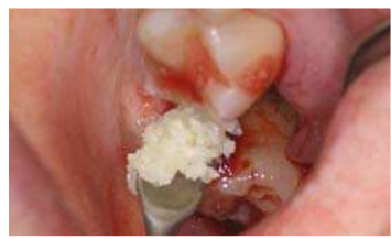
Placing the bone graft