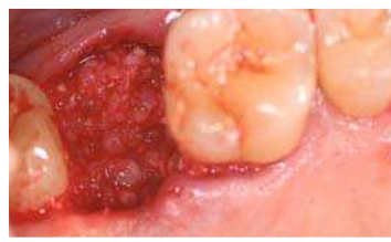
Placed bone graft