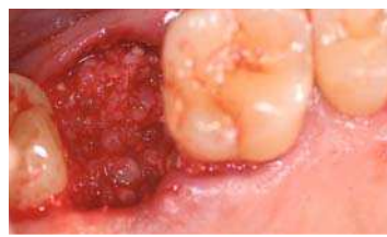
Placed bone graft