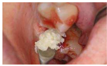
Placing the bone graft