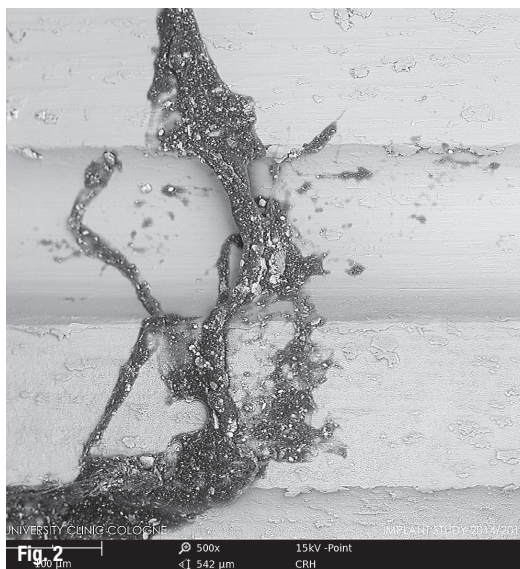
Fig. 2: Organic pollution on a titanium-made implant (SEM x500), left.