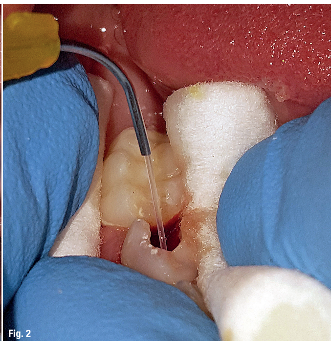
Figs. 1 & 2: The laser is a helpful tool in the dental treatment of children that can be used for various procedures.