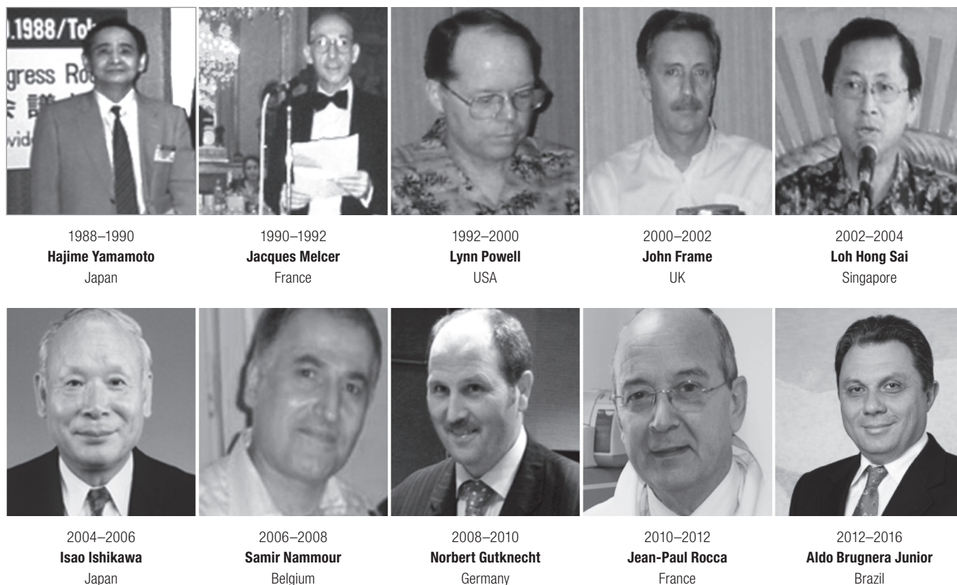
Fig. 5: Past Presidents of ISLD/WFLD.