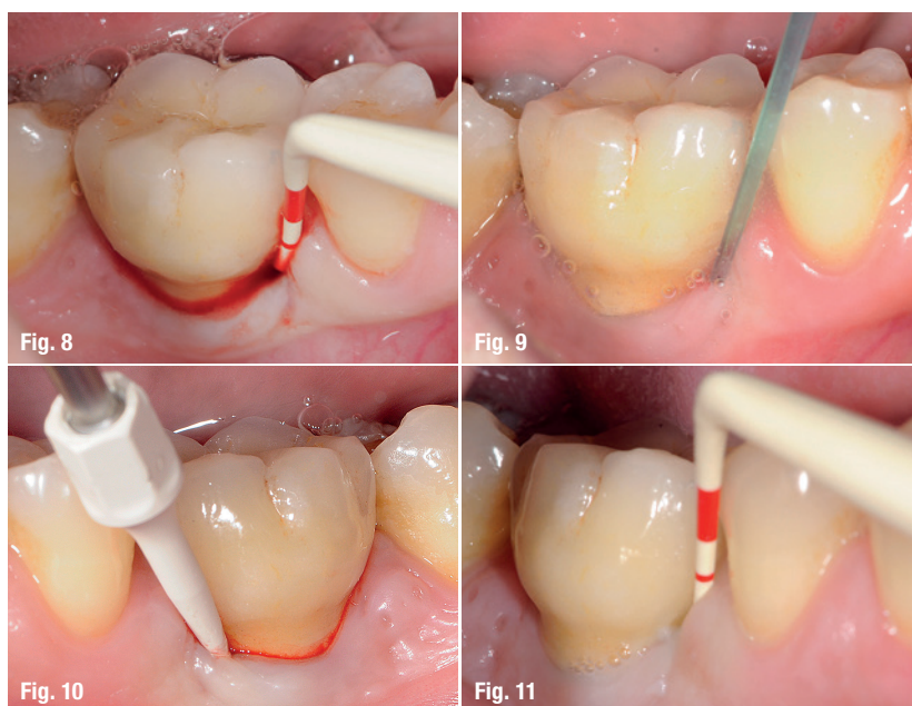
Fig. 8: Clinical situation of the peri-implant mucositis site. Implant with probing depth \leq 5 mm and bleeding on probing. Fig. 9: Application of PERISOLV® before the non-surgical therapy. Fig. 10: After an exposure time of 30 seconds, the biofilm was removed non-surgically using an ultrasonic device with a PEEK tip. Fig. 11: Situation six months after therapy. Probing depth of \leq 4 mm and no bleeding on probing.

The activity of PERISOLV® was found to be different for Gram-positive and Gram-negative bacteria. Gram-negative bacteria were inactivated even at a low PERISOLV®