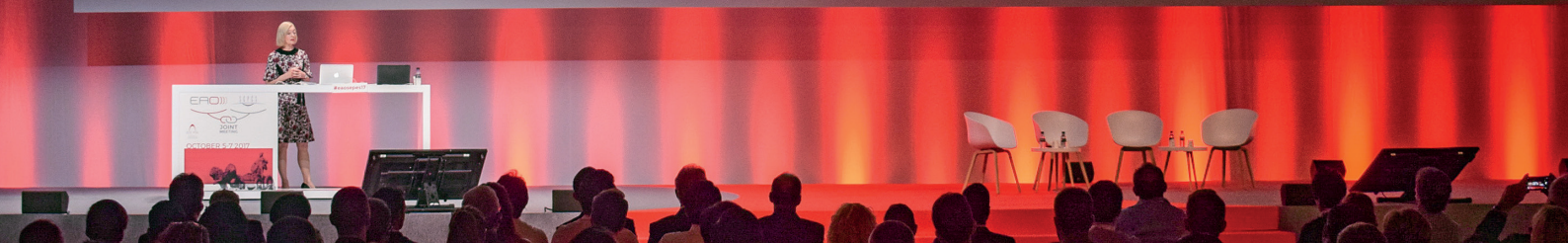
Figs. 1 & 2: Dr Lisa Heitz-Mayfield at the 26 th EAO Meeting in October 2017, highlighting the importance of infection control.

tinue to do so. That is the key to prevention: to make sure that the patient has a healthy oral cavity with little plaque and no periodontal disease before one starts.