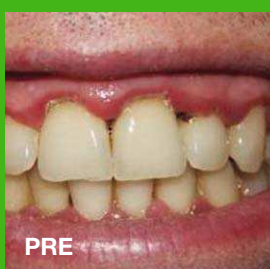
EmunDo® - Treatment