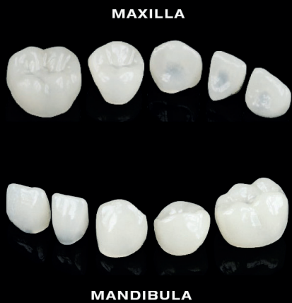
VENEERS & OCCLUSIONVDS