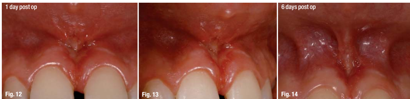
Fig. 12–15 _Post-operative follow-up.

surgery, enabling a clear view for the surgeon and making the procedure fast. No further coagulation was necessary. No sutures were required. A swab was placed for 30 seconds at the end of the laser treatment. The compliance of the patient during treatment was very good.