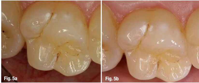
Fig. 5a Clinical aspect of the incipient caries lesion on tooth 26 at baseline. Fig. 5b After 26 months of follow-up. Note that the lesion's characteristics, such as smoothness and brightness, indicate caries inactivity.

According to the manufacturer's instructions (Fig. 2). The device was first calibrated using a ceramic standard and then calibrated on the buccal surface of the right permanent central incisor. For measurements, tip A for occlusal surfaces was used. The device was moved through the entire occlusal surface until the highest value was obtained (peak value).