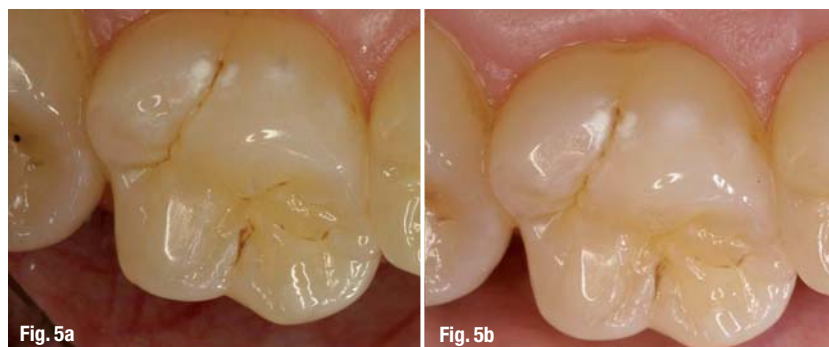
Fig. 5a Clinical aspect of the incipient caries lesion on tooth 26 at baseline.