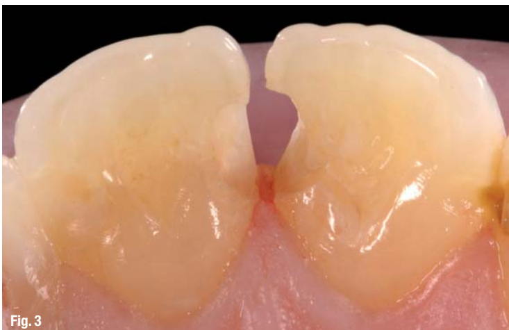
Fig. 3 View after removal of the old fillings.

The clinical case described here involved the replacement of two defective proximal restorations (Fig. 1). An initial analysis of the various shade layers of which the natural teeth were