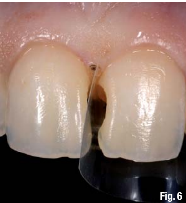
Fig. 4 Defects viewed from the vestibular aspect. Fig. 5 Beveling of the preparation margin using diamond abrasive strips. Fig. 6 Placement of the matrix band. Fig. 7 Palatal view. Fig. 8 Application of the first composite increment. Fig. 9 Further IPS Empress Direct Dentin Shade A3 increment. Fig. 10 Completion of the dentine core using IPS Empress Direct Dentin Shade A2. Fig. 11 Coverage with IPS Empress Direct Enamel Shade A2. Fig. 12 Contouring of the final tooth shape using IPS Empress Direct Trans Opal.

used to bevel the preparation margin (Fig. 5). Thus, minimally invasive roughening and beveling of the enamel surface were ensured in the equi-gingival cervical region. Following etching with phosphoric acid and conditioning with Excite bonding agent (Ivoclar Vivadent), a matrix band was placed (Fig. 6). The band was slid into the sulcus along the proximal tooth surface and secured with a transparent wedge from the palatal side (Fig. 7). The anaemic appearance of the surrounding gingiva indicated that non-traumatic compression of the tissue had been achieved. In the palatal view, the size-1 wedge is clearly visible. Owing to the pressure it exerts, the interdental space was slightly enlarged. The matrix band was secured once in an optimum position. Then the first layer of composite material (IPS Empress Direct Dentin Shade A3) was placed