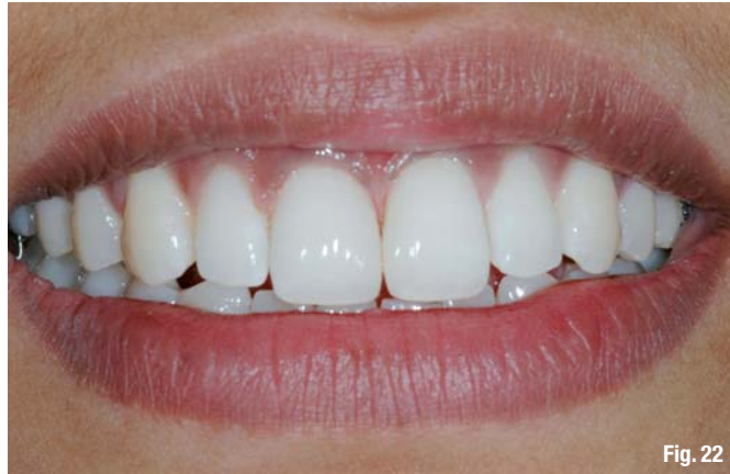
Fig. 22_Final smile.

Beautiful Flow Shade #A3T with giomer adhesive system FL-Bond II (SHOFU Inc.) were used in FFT to create the lingual frame. Beautiful II (SHOFU Inc.) dentine shade A1 and enamel shade Inc. were used to restore the defects using the bi-layered shading technique to achieve the desired aesthetics with an invisible restoration. The Direct Cosmetic Restoration Kit and the Super-Snap Rainbow Technique Kit (both SHOFU Inc.) were used to prepare the teeth and to finish and polish the final restorations (Figs. 7-22).