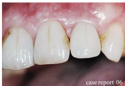
case report 06