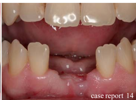
case report 14