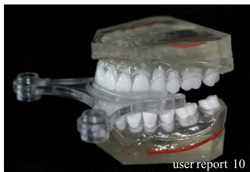
user report 10