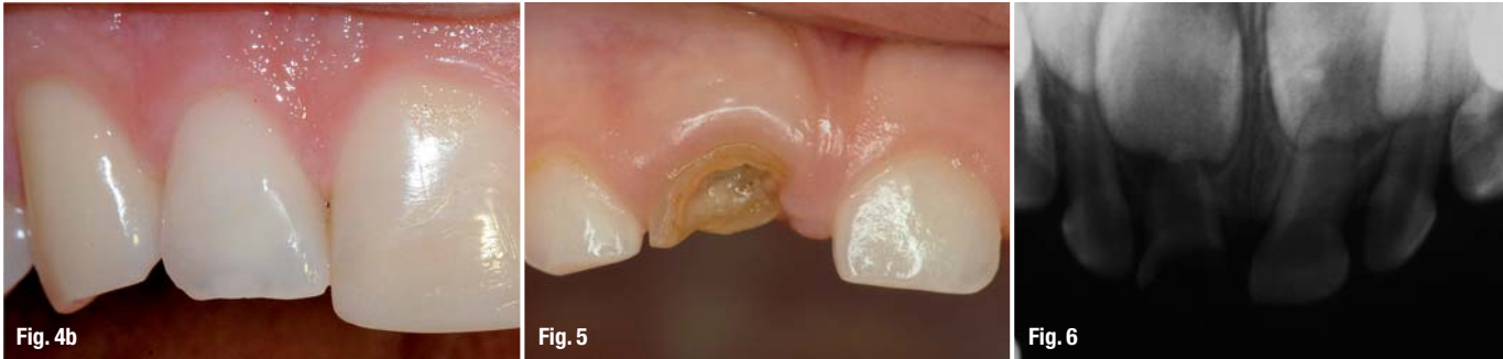
Fig. 5 Patient aged 4.2 years. Complicated crown fracture. Three months have elapsed since the trauma occurred. Gingival hypertrophy of 5.1 covers the fracture margin.