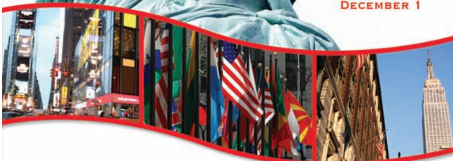
EXHIBIT DATES: NOVEMBER 28 - DECEMBER 1