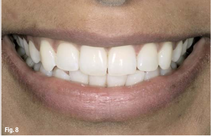
Fig. 7_Smile view before treatment. Fig. 8_Smile view after treatment.