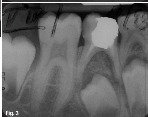
Figs. 1–4 11-year-old patient. Treatment of the lower gangrenous second primary molar.