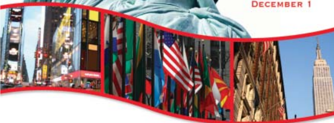
EXHIBIT DATES: NOVEMBER 28 - DECEMBER 1