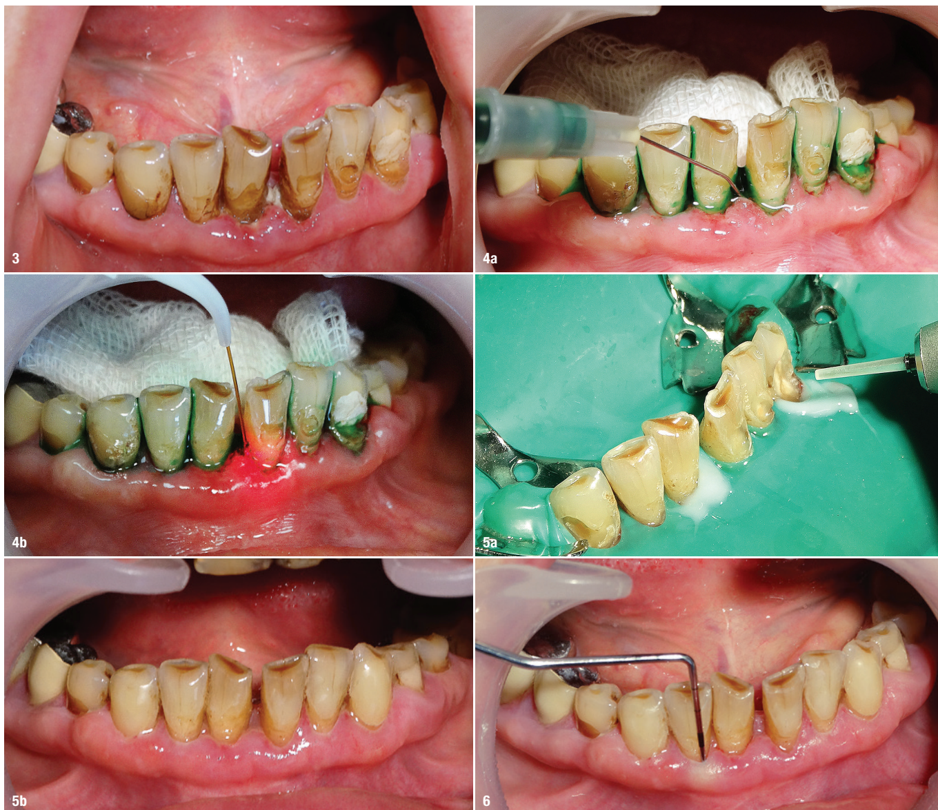
Fig. 3: Postoperative view of the soft tissues after 14 days. Fig. 4a: Application of indocyanine green dye. Fig. 4b: Light activation of the dye with 810 nm diode laser. Fig. 5a: Er:YAG laser-assisted tooth structure preparation for adhesive obturation. Fig. 5b: Postoperative result after three weeks. Fig. 6: Periodontal status after six months.

still visible, thus indicating the need for antibacterial photodynamic therapy (aPDT). This is a novel approach in supplementary periodontal treatment. It involves the application of a specific dye into the periodontal pockets, which—when activated with a specific light wavelength—dissipates into reactive oxygen species (ROS). In the periodontal pockets, ROS have high cytotoxic properties against most of the periodontal flora. aPDT is a non-thermal and non-invasive local therapy, bearing numerous beneficial effects. For this case, aPDT was performed using indocyanine green dye (EmunDo; Fig. 4a), mixed ex tempore and activated with an 810nm diode laser (Syneron Dental; Fig. 4b). Indocyanine green is a fluorescent dye with an absorption spectrum of between 750 and 850nm wavelength. Hence, a diode laser system operating at a wavelength of 810nm is deemed its op-