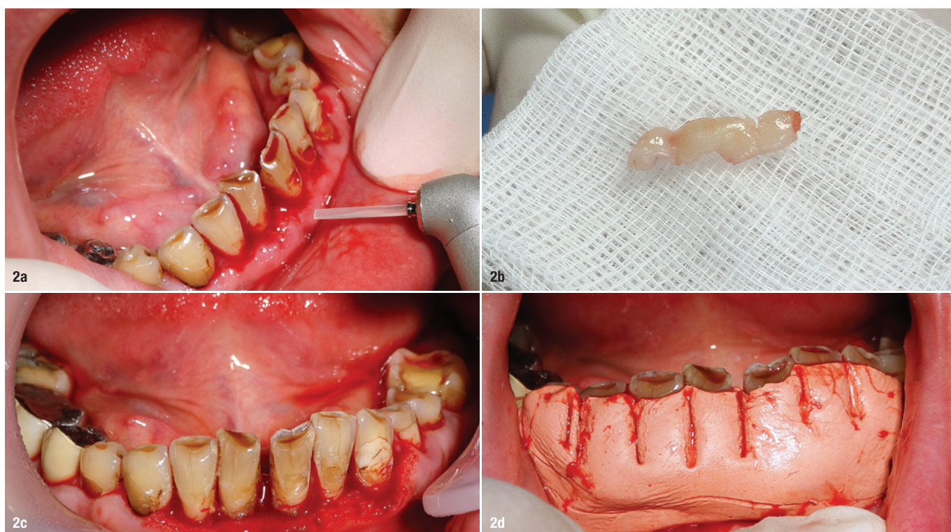
Fig. 2: Performance of gingivectomy with Er:YAG laser (a); view of the excised soft tissue (b); immediate postoperative view of the treated area (c); placement of periodontal dressing (d).

After two weeks, the epithelisation process finalised uneventfully (Fig. 3). However, signs of inflammation were