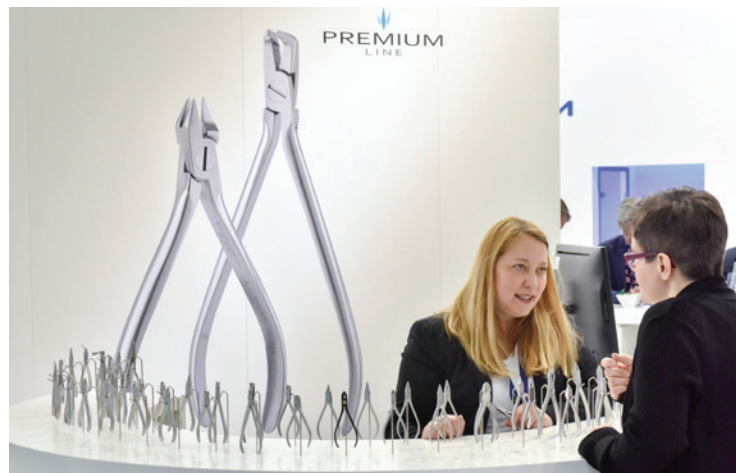
▲ Proven and innovative products, both small and large, aid in daily dental routines—and will be available at IDS 2021.