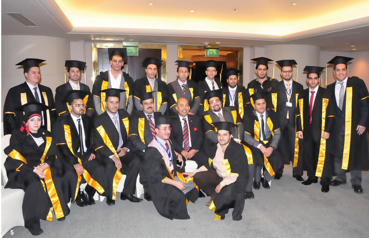
Fig. 5: GBOI graduation ceremony in Cairo, Al Jazira Sofitel Hotel.

The new DGZI Online Campus has been completely redesigned and enables e-learning from all devices and from anywhere with Internet access. Well-prepared content, intermediate examinations and a final examination provide the participant with constant feedback on the level of knowledge he or she has achieved and thus