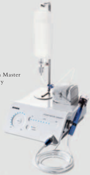
Piezon Master Surgery

EINZIGARTIG in der Welt der Chirurgie – das 3-Touch-Panel zur intuitiven Bedienung.