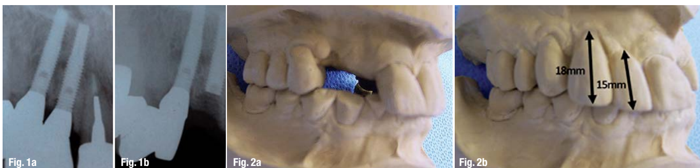
Figs. 2a & b _Retrospective analysis of the site planned for the implants #6 and #7 (A) revealed an extended overbite, requiring long crowns (B) to meet esthetic needs, and at the same time, the opposing occlusion presented extensive occlusal wear.