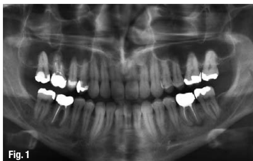
Fig. 2_ Bone block, stored in Ringer's solution.